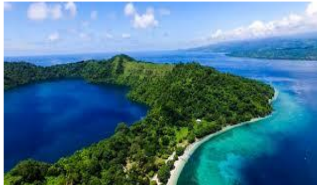
Satonda Island & lake