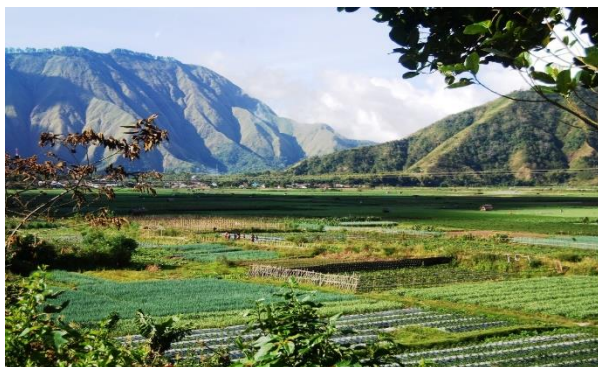
Lombok island lush landscape