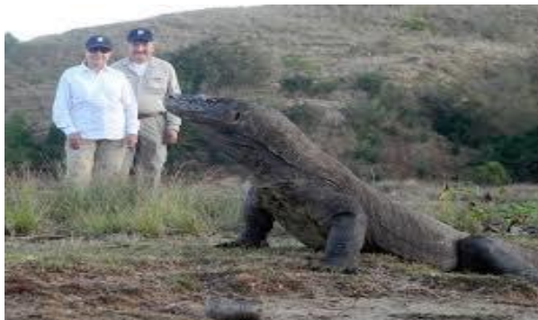
Komodo dragon at Rinca Island