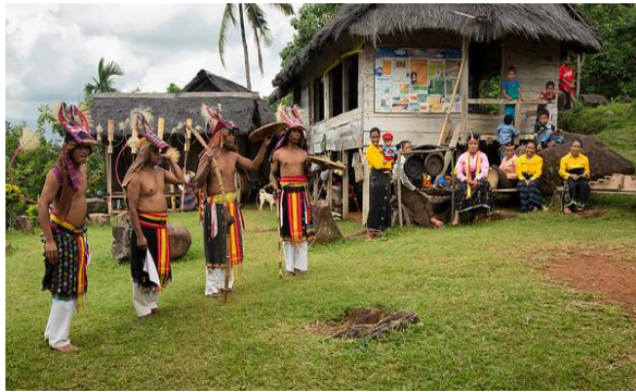
Flores Island- The Manggarai Tribe